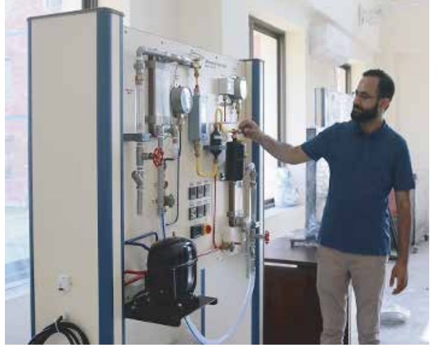
Smart Class Rooms